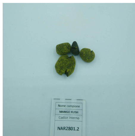
SAMPLE ANALYZED: Fedora 17(4.00gr)