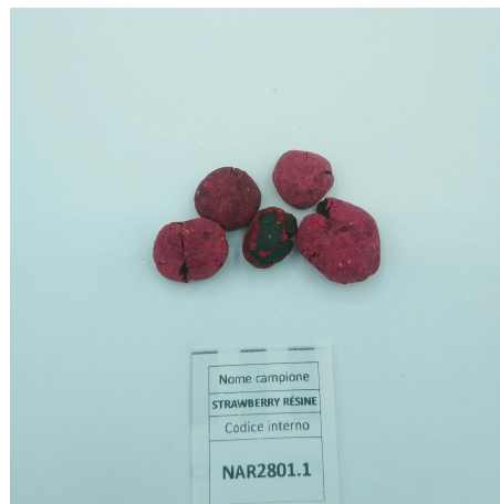
SAMPLE ANALYZED: Fedora 17(4.00gr)